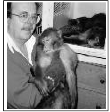
The two Japanese Snow Monkeys rescued by Lifeforce in 1995.

Present Animal Performance Bans enacted in BC with the help of Lifeforce and other organizations can be used as a model for protecting primates in other countries. Our plans for further restrictions through stronger bylaws and legislation will further protect primates and other wildlife.