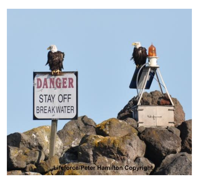
Eagles at Point Roberts Marina

On Monday June 29th at 0625 a few orca orcas passed Point Roberts heading Southeast. They were difficult to identify due to frigid strong winds whipping up 4 foot waves. They were just travelling through with scarce surfacings then long dives. We usually see individual orcas doing several surfacings as they approach and round the park point. It is possible that these were the trailers since I'm quite sure that there was a breach and some blows off in the distant rough waters earlier this morning. Sometimes groups will travel pass with a separation time of over one hour.