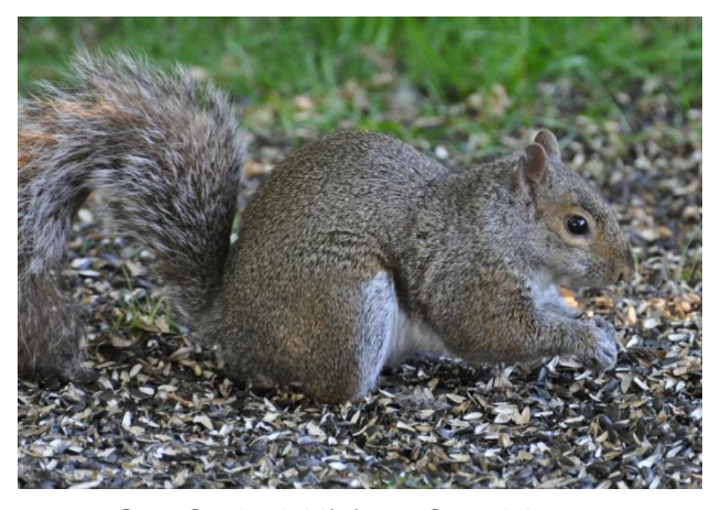
Gray Squirrel.

Lifeforce Wildlife Reports, Nature Moments videos, and Wildpeace photographs are available at www.lifeforcefoundation.org.