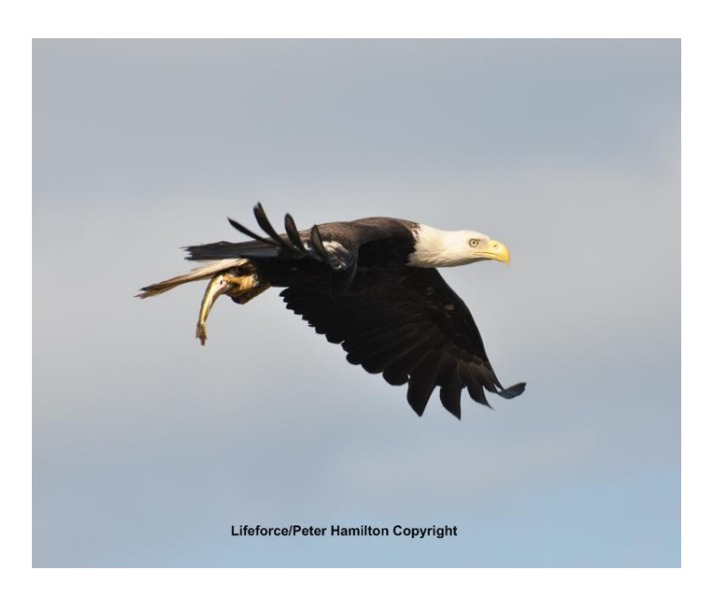
Eagle with bullhead in talons

Later in the day a deer was at the front entrance of the park.