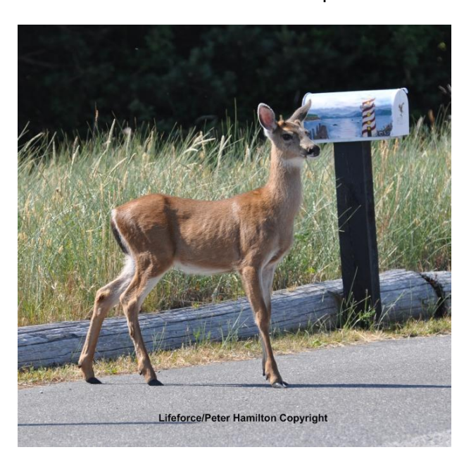
Deer at Lighthouse Marine Park

Later in the day a deer was at the front entrance of the park.