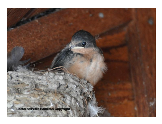
Contemplating that first flight

Two Barn swallows took their first flight around the park in Point Roberts. One waited a bit nut eventually wanted to fly like the others.