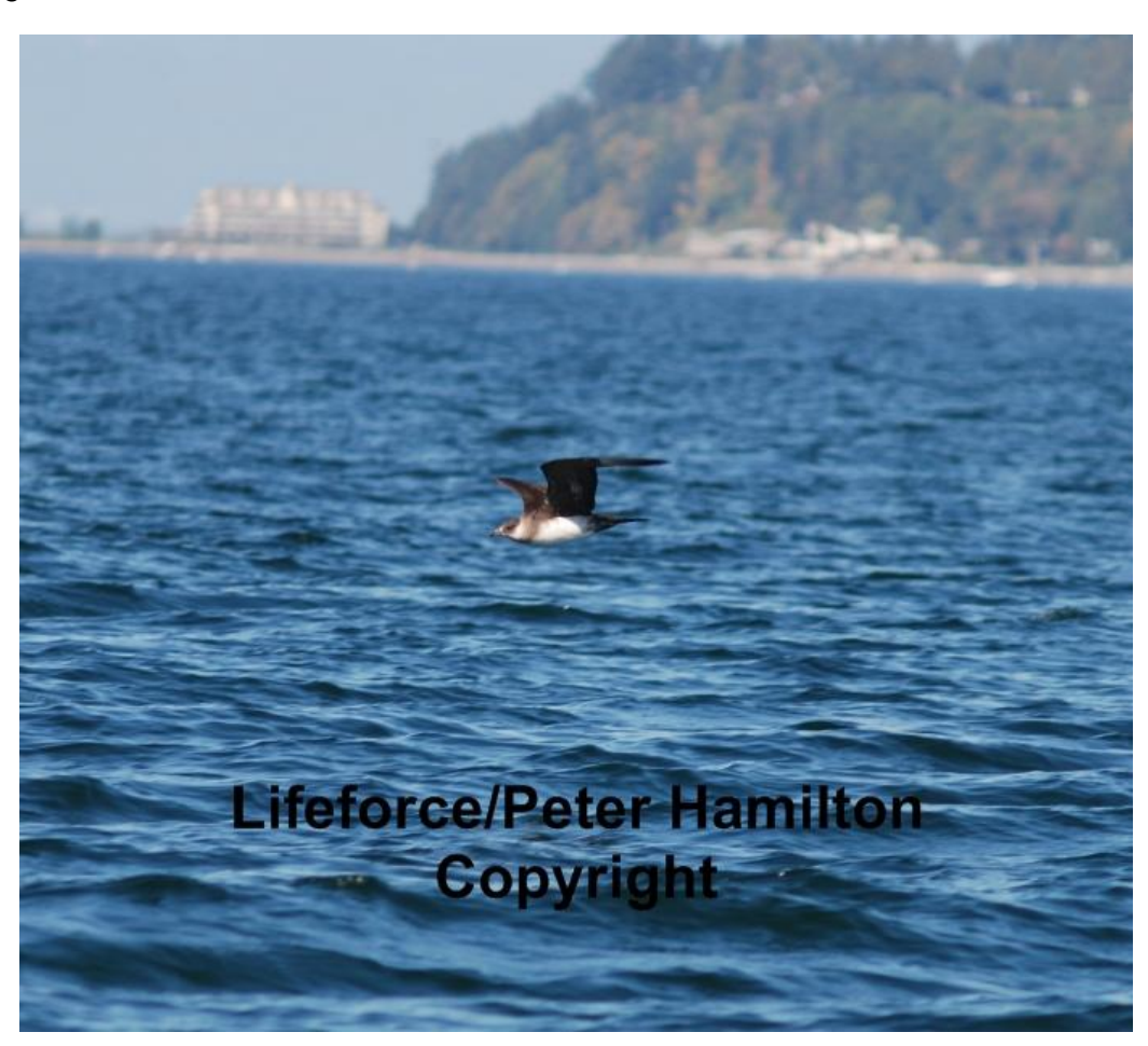
Parasitic Jaeger chasing Bonapart Gull