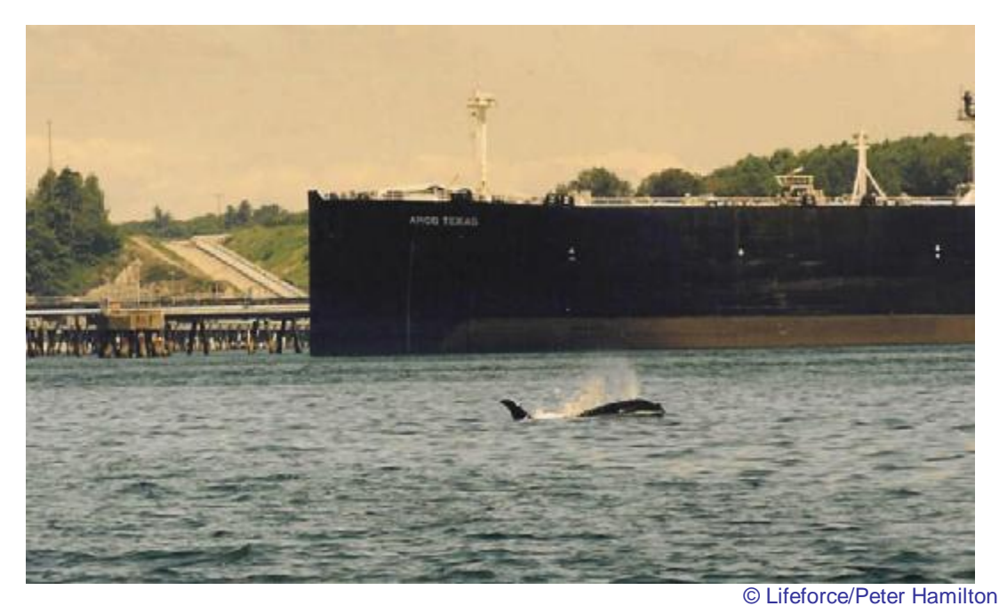
Cherry Point, WA

The ongoing accidents involving oil spills reinforces the need for immediate emergency plans to protect the endangered orcas travelling in these waters. The Lifeforce Foundation has been developing methodology to protect orcas and other wildlife from these life-threatening hazards.